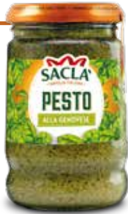
PESTO ALLA GENOVESE Classic basil pesto