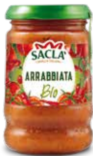
ARRABBIATA Organic tomato & chilli pasta sauce