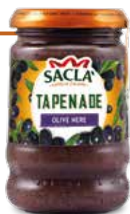
TAPENADE OLIVE NERE Black olives tapenade