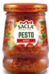
PESTO ROSSO Sun-dried tomato pesto