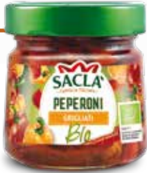
PEPERONI GRIGLIATI Organic grilled peppers