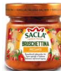
BRUSCHETTA PICCANTE Spicy bread topping tomato, pepper and red onion