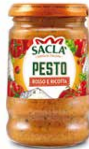
PESTO ROSSO E RICOTTA Pesto with tomatoes and Ricotta cheese