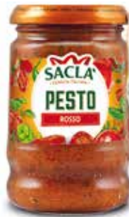
PESTO ROSSO Sun-dried tomato pesto