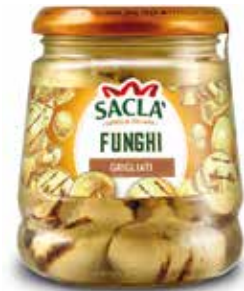
FUNGHI GRIGLIATI Grilled mushrooms