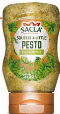
PESTO ALLA GENOVESE Classic basil pesto