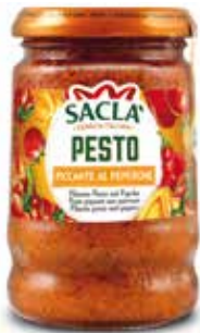
PESTO PICCANTE AL PEPERONE Chilli pesto with pepper