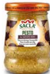
PESTO AL TARTUFO NERO Black truffle pesto