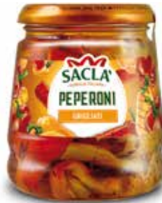
PEPERONI GRIGLIATI Grilled peppers