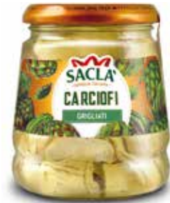
CARCIOFI GRIGLIATI Grilled artichokes