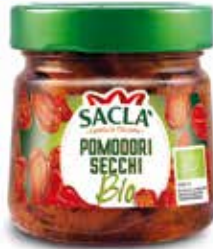
POMODORI SECCHI Organic sun-dried tomatoes