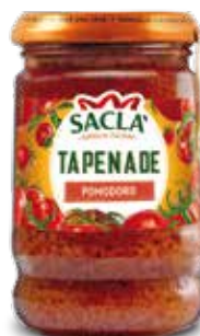
TAPENADE POMODORI SECCHI Sun-dried tomato tapenade