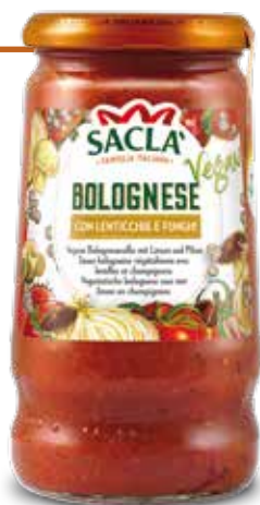
BOLOGNESE VEGANA Vegan tomato, lentils and mushrooms pasta sauce