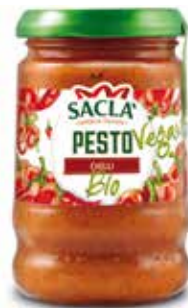
PESTO PICCANTE VEGANO CON TOFU Organic vegan chilli pesto with tofu