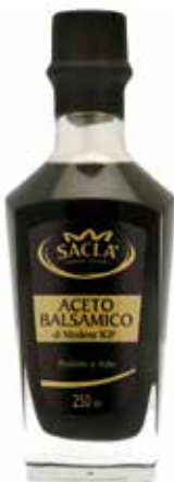
ACETO BALSAMICO DI MODENA IGP 250ml Italian sweet dark vinegar gold label - density 1.32