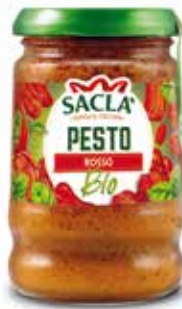
PESTO ROSSO Organic sun-dried tomato pesto