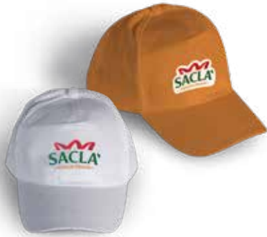
CAP WITH SACLÀ LOGO