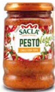
PESTO PICCANTE VEGANO CON TOFU Vegan chilli pesto with tofu