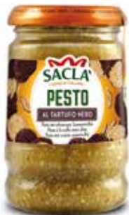
PESTO AL TARTUFO NERO Black truffle pesto