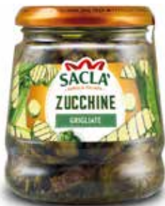
ZUCCHINE GRIGLIATE Grilled courgettes