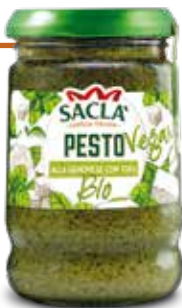
PESTO ALLA GENOVESE VEGANO CON TOFU Organic vegan classic pesto with tofu