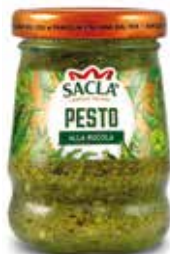
PESTO ALLA RUCOLA Rocket pesto