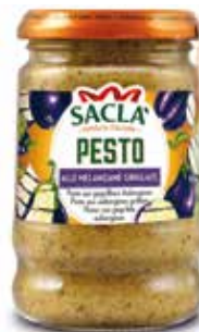
PESTO ALLE MELANZANE GRIGLIATE Char-grilled aubergine pesto