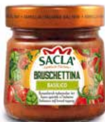
BRUSCHETTA AL BASILICO Bread topping tomato and basil