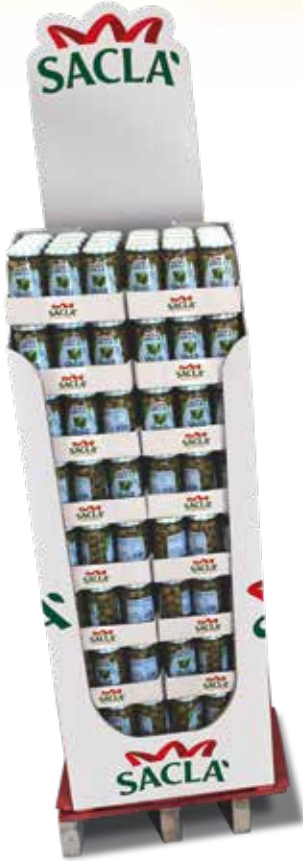
Capacity 240 jars (T212 - Pesti)