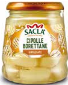
CIPOLLE BORETTANE GRIGLIATE Grilled Borettane onions