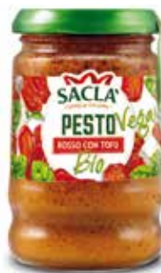
PESTO ROSSO VEGANO CON TOFU Organic vegan tomato pesto with tofu