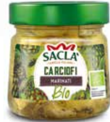
CARCIOFI MARINATI Organic marinated artichokes