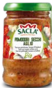
POMODORI SECCHI E AGLIO Organic sun-dried tomato and garlic pasta sauce