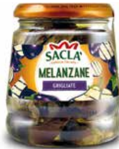
MELANZANE GRIGLIATE Grilled aubergines