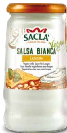
SALSA BIANCA VEGANA PER LASAGNE Vegan white sauce for Lasagne