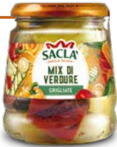
VERDURE GRIGLIATE Mixed grilled vegetables