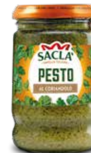
PESTO AL CORIANDOLO Coriander pesto