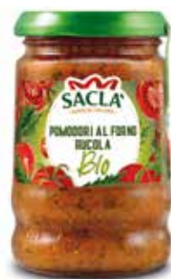
POMODORI AL FORNO E RUCOLA Organic oven roasted tomato and rocket pasta sauce