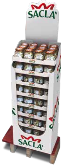
Capacity 96 jars (G314 - Antipasti)