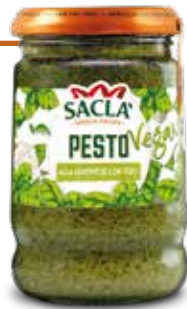
PESTO ALLA GENOVESE VEGANO CON TOFU Vegan classic pesto with tofu