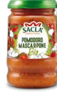
POMODORO E MASCARPONE Organic tomato and Mascarpone pasta sauce