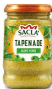
TAPENADE OLIVE VERDI Green olives tapenade