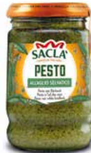
PESTO ALL'AGLIO SELVATICO Wild garlic pesto