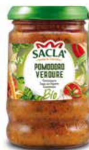
POMODORO E VERDURE Organic tomato and vegetables pasta sauce