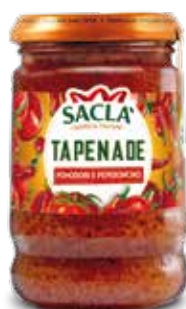
TAPENADE POMODORO E PEPERONCINO Tomato and chilli tapenade