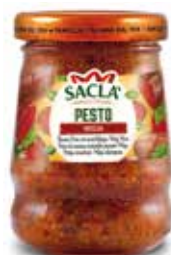
PESTO 'NDUJA 'Nduja pesto