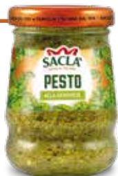
PESTO ALLA GENOVESE Classic basil pesto