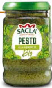
PESTO ALLA GENOVESE Organic classic basil pesto