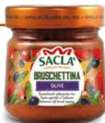
BRUSCHETTA ALLE OLIVE Bread topping tomato and olives