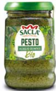
PESTO ALL'AGLIO SELVATICO Organic wild garlic pesto