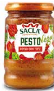
PESTO ROSSO VEGANO CON TOFU Vegan tomato pesto with tofu