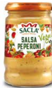
SALSA PEPERONI E MANDORLE VEGANA Vegan peppers and almonds sauce